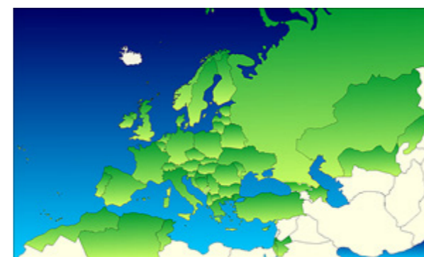
Current EPPO member countries are shown in green

The European and Mediterranean Plant Protection Organization (EPPO) is an intergovernmental organization responsible for international cooperation in plant protection in the European and Mediterranean region. In the sense of the article IX of the FAO International Plant Protection Convention (IPPC), it is the Regional Plant Protection Organization for Europe. Founded in 1951 with 15 member governments, it now has 52 member governments including nearly every country of Western and Eastern Europe and the Mediterranean region.