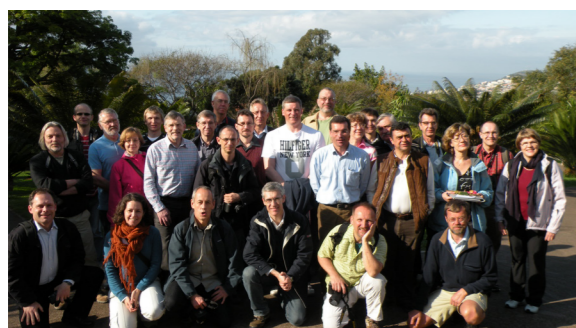
EPPO Panel on Quarantine Pests for Forestry (Madeira, 2011-03-29/31)

EPPO's technical activities are directed by two Working Parties (on Phytosanitary Regulations, and on Plant Protection Products). Their respective programmes cover: limiting the spread of pests between countries (broadly plant quarantine) and harmonizing activities on plant protection products within countries. Each Working Party meets once a year. The meetings are held in member countries throughout the EPPO region.