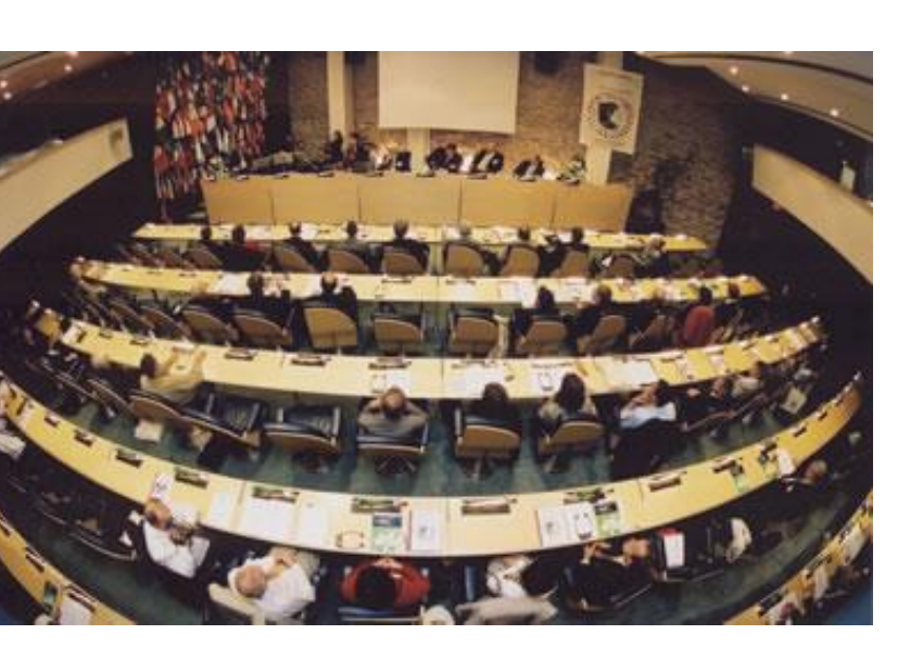
EPPO Council Session